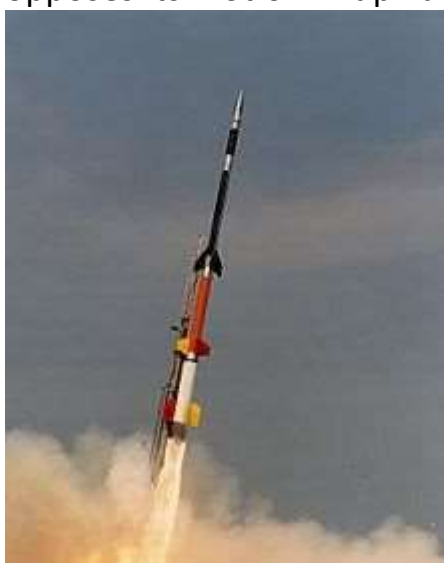
Rocket Fired Upwards

Q10. When we press the bulb of a dropper with its nozzle kept in water, air in the dropper is seen to escape in the form of bubbles. Once we release the pressure on the bulb, water gets filled in the dropper. The rise of water in the dropper is due to