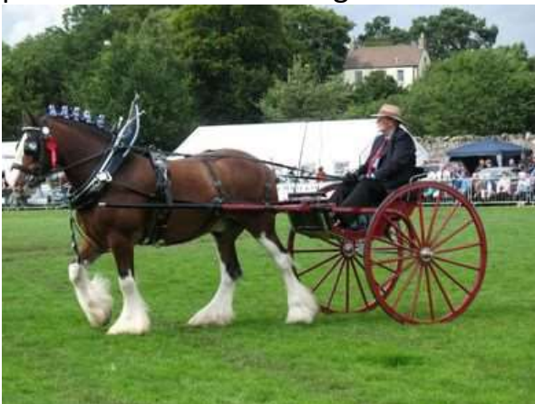
Horse Pulling a Cart

(b) In order to change the place of the heavy box from one room to another, we have to push it. This action changes the motion of the box.